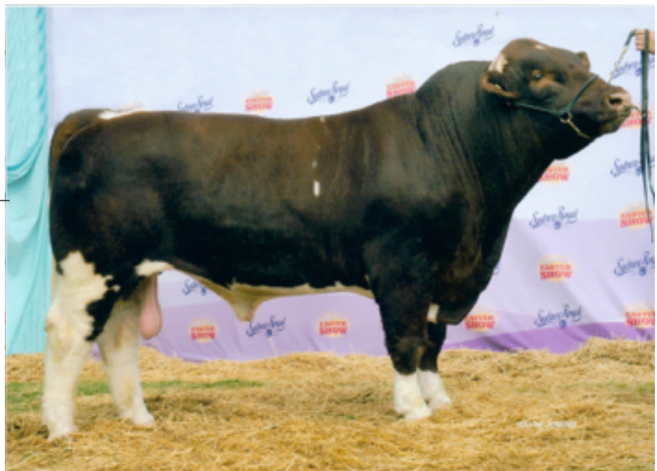
SENIOR & GRAND CHAMPION BULL & SUPREME EXHIBIT— ROUGE DE PRES SUPREME