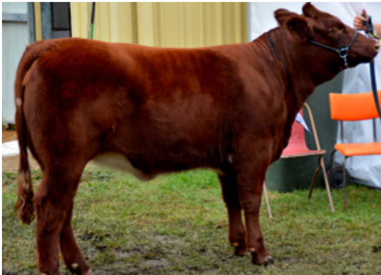
JUNIOR & GRAND CHAMPION FEMALE— UANDI XO FLOSS 2